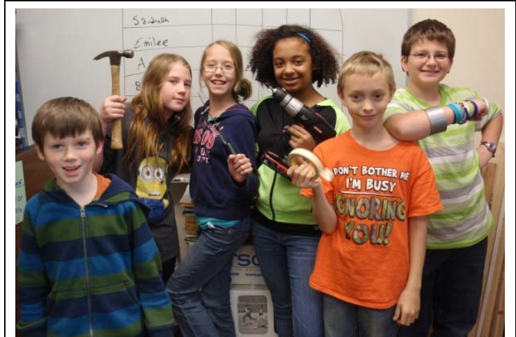
The Duct Tape Carpenters

The Rubber Band Rappers were the highest scoring junior level team from Nikiski on the Spontaneous Problem, and had the 7 th highest Spontaneous score out of 39 junior level teams.