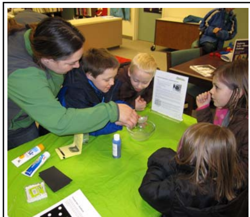
The Ehler family conducts an experiment together at last month's Family Science Night.