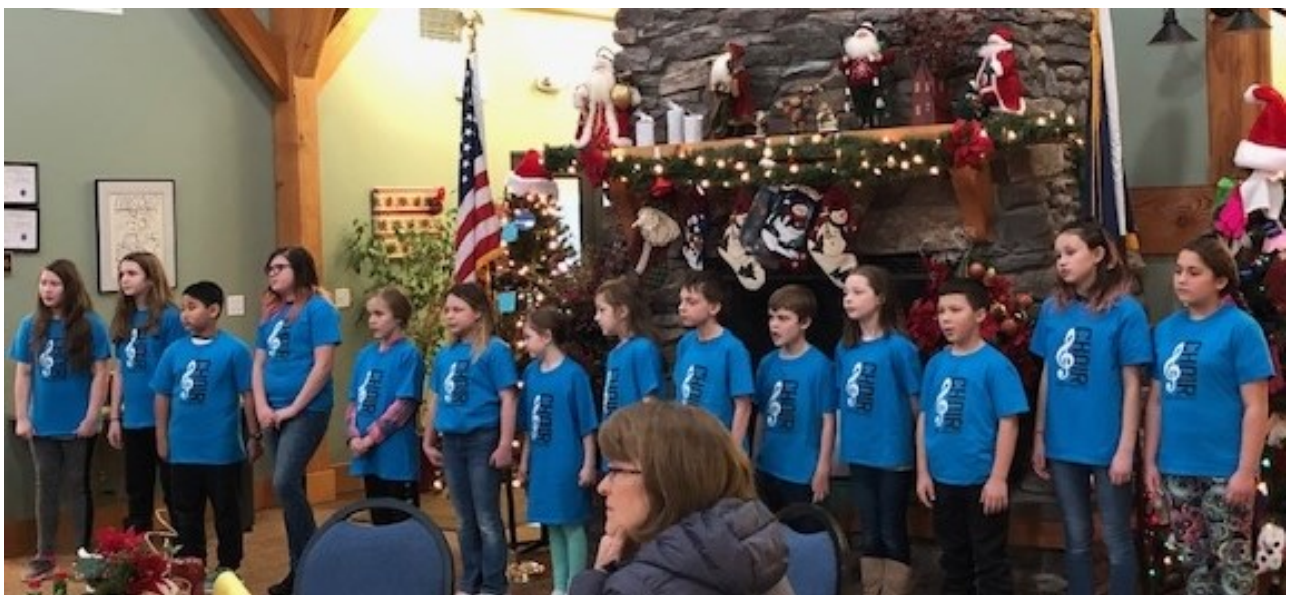
The Nikiski North Star Choir performed at the Nikiski Senior Center last month.